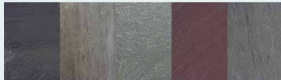
CANADIAN BLACK MOTTLED GRAY-BLACK SEMI-WEATHERING GRAY-GREEN ROYAL PURPLE SEMI-WEATHERING GRAY