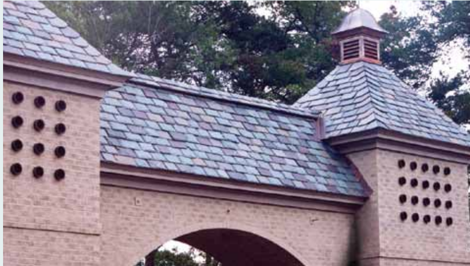
MURR & LANNEY

Vermont Natural Slate colors, sizes and texture afford many architectural effects, contributing to the appearance and beauty of any building.